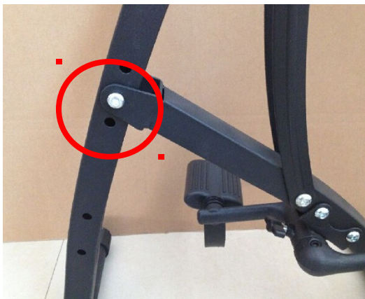
A. use the screw to fix the pedal