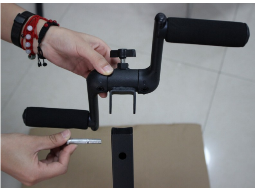
Install the hand bar