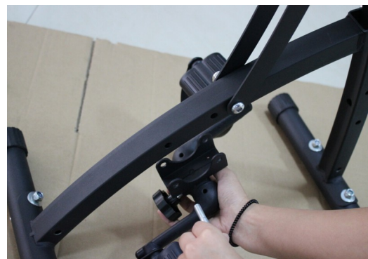
Install the pedal